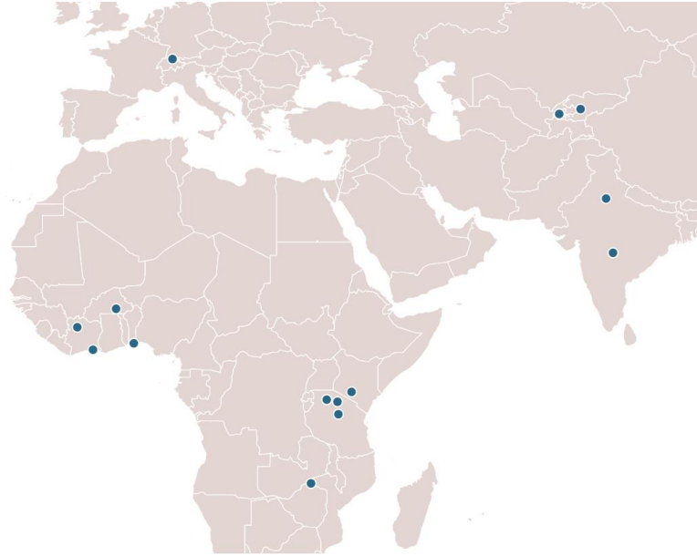
Figure 2: Location of international corporate responsibility projects that address community engagement and welfare of smallholder farmers.